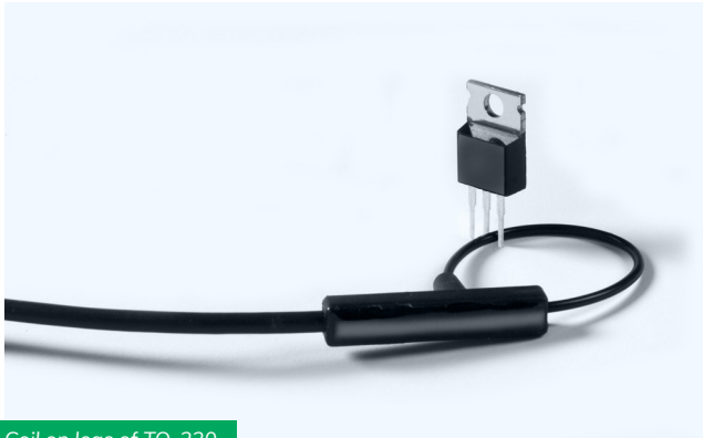
Coil on legs of TO-220

The CWT Ultra-mini (CWTUM) has an extremely thin, clip-around coil of typically 1.6mm cross section. With such a thin coil it is possible to access even the most difficult to reach parts of a power electronic converter with negligible disruption to the circuit under test.