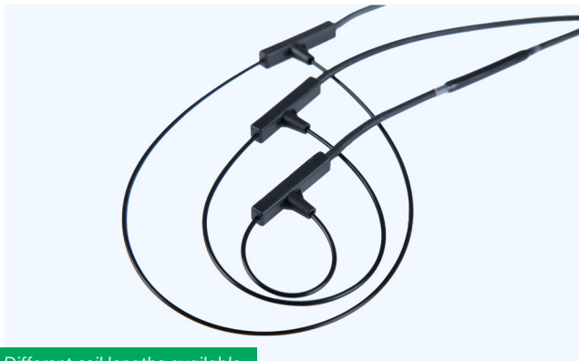
Different coil lengths available