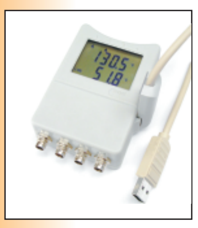
Data logger S0141 (S0541, S0841, S0842) with USB adapter